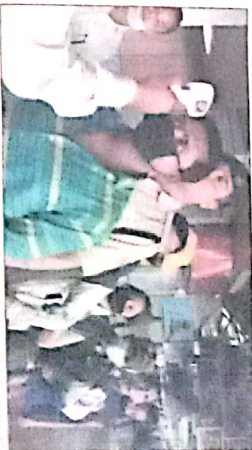
Thermal screening of passengers at Guwahati Railway Station on March 16

“It’s a temporary stop before the district authority takes over,” an official explained. Meanwhile, Railway officials have urged passengers having any symptoms or coming from any of the affected countries and regions to contact the station superintendent so that appropriate steps could be taken and such passengers forwarded to Dimapur chief medical office.